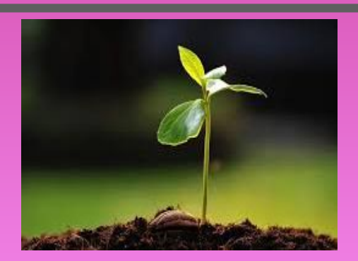
Why are you cast down, O my soul, and why are you in turmoil within me? Hope in God; for I shall again praise him, my salvation and my God. (Psalm 43:5)

In these times of uncertainty and sadness because of all that is happening in our world, we can only HOPE in God, trust and put our lives in His hands. Amen!