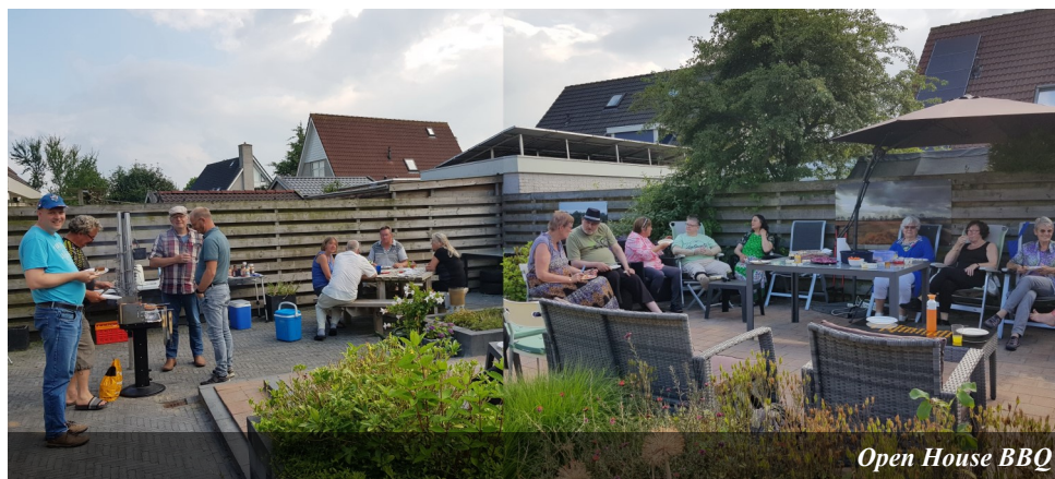
Open House BBQ